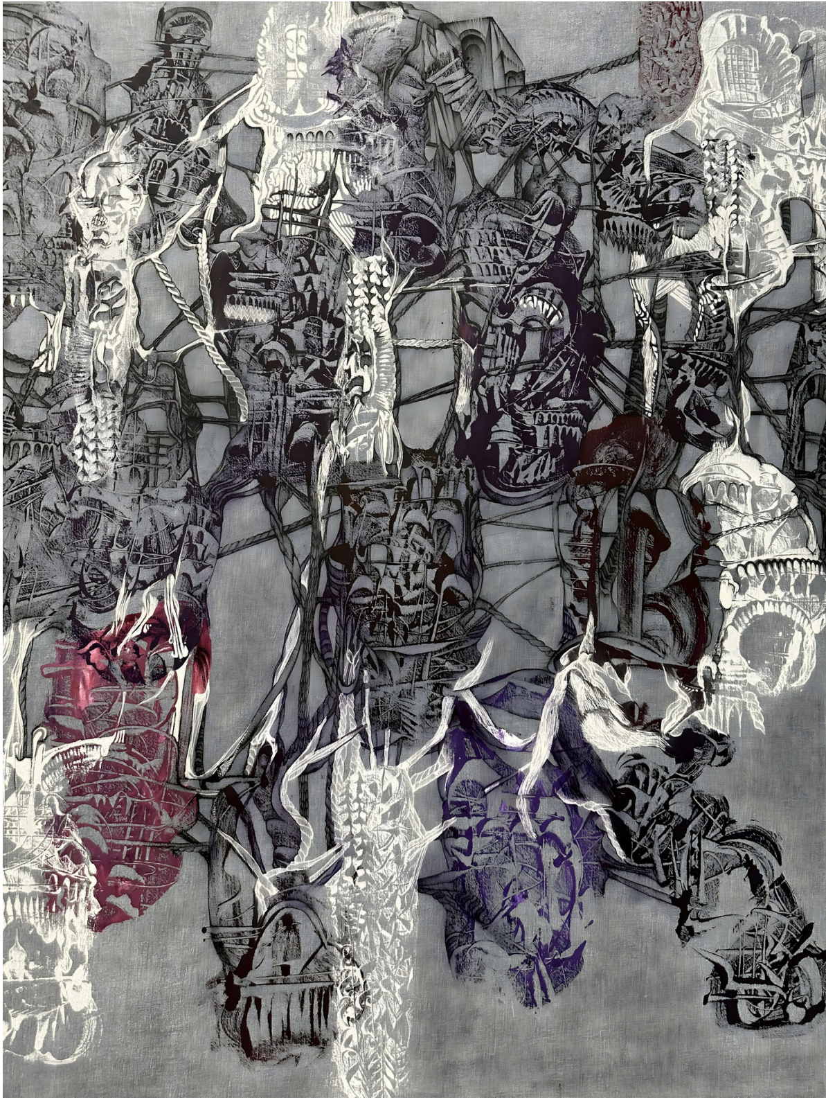
The Silent Bells, 2025 Acrylic and ink on denim 127x155 cm $ 17,000